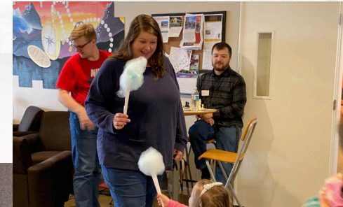
Alumni, supporters, and students attended the Spring Open House. Activities included cotton candy, inflatables, face painting, and games.