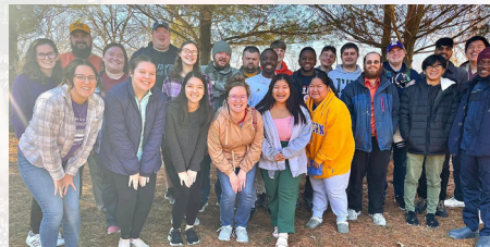
Staff and students attended Winter Retreat at Little Galilee Christian Camp with other Illinois campus ministries. The topic was "Love Reframed".