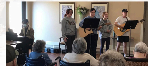
Students serve at the Elms Rehabilitation Center every other week by providing worship, devotionals, and activities for the residents.