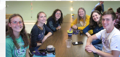
Sunday Night Dinners are provided by supporting churches and help to raise money for CSC mission trips.