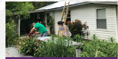
Students help with house construction during the Red Bird mission trip in Kentucky in May 2022.