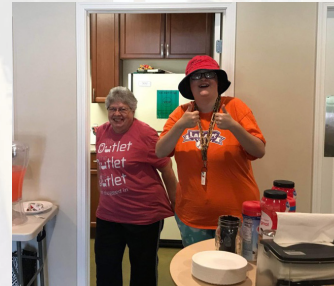
Partnering churches attended a work day in July 2022 to help complete various projects around the ministry.