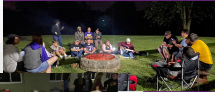
Students at the 2021 Fall Retreat enjoying worship around the campfire