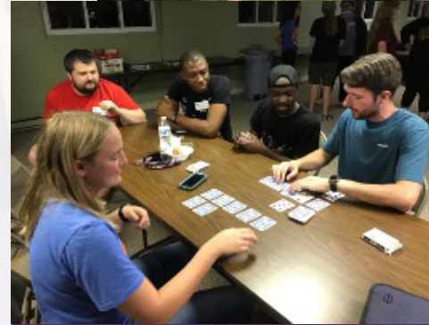
Students playing cards at Birthday Cake night after Wednesday small groups