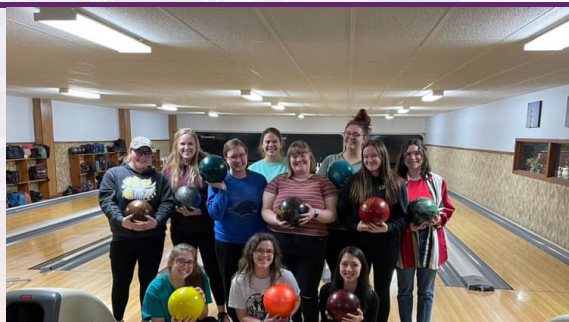
Women's Bowling Night