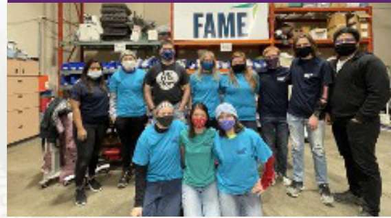
FAME Trip in January