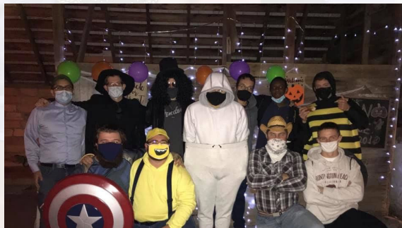
The CSC Men at the Barn Party in October!