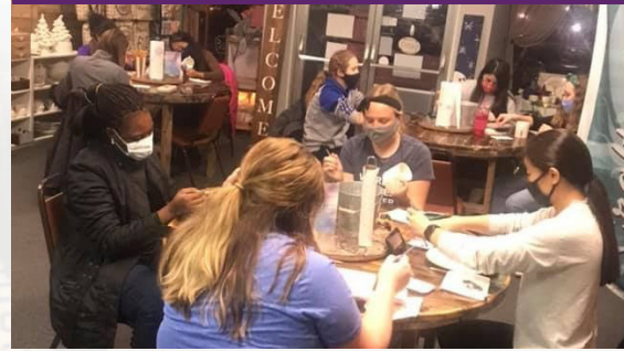
CSC Women's Night at the Crafty Coop in Macomb!