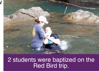
2 students were baptized on the Red Bird trip.