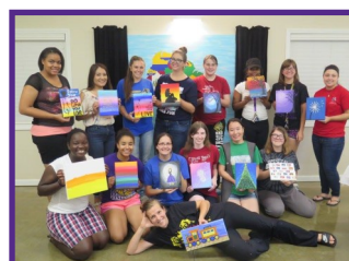
Ladies Paint Night!