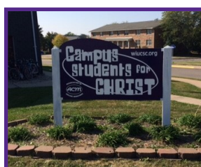
Our New Sign!