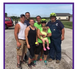
International Friendship Ride