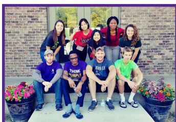
Student Small Groups

CSC had a successful and busy summer break with the renovation of Apartment 11, the First-Ever International Friendship Ride (raised over $700), a new website design, and numerous building maintenance projects! We have a new sign out front (see below), some more work done in the auditorium for sound control and stage design, and a new CSC Library/Prayer Room in the old center office.